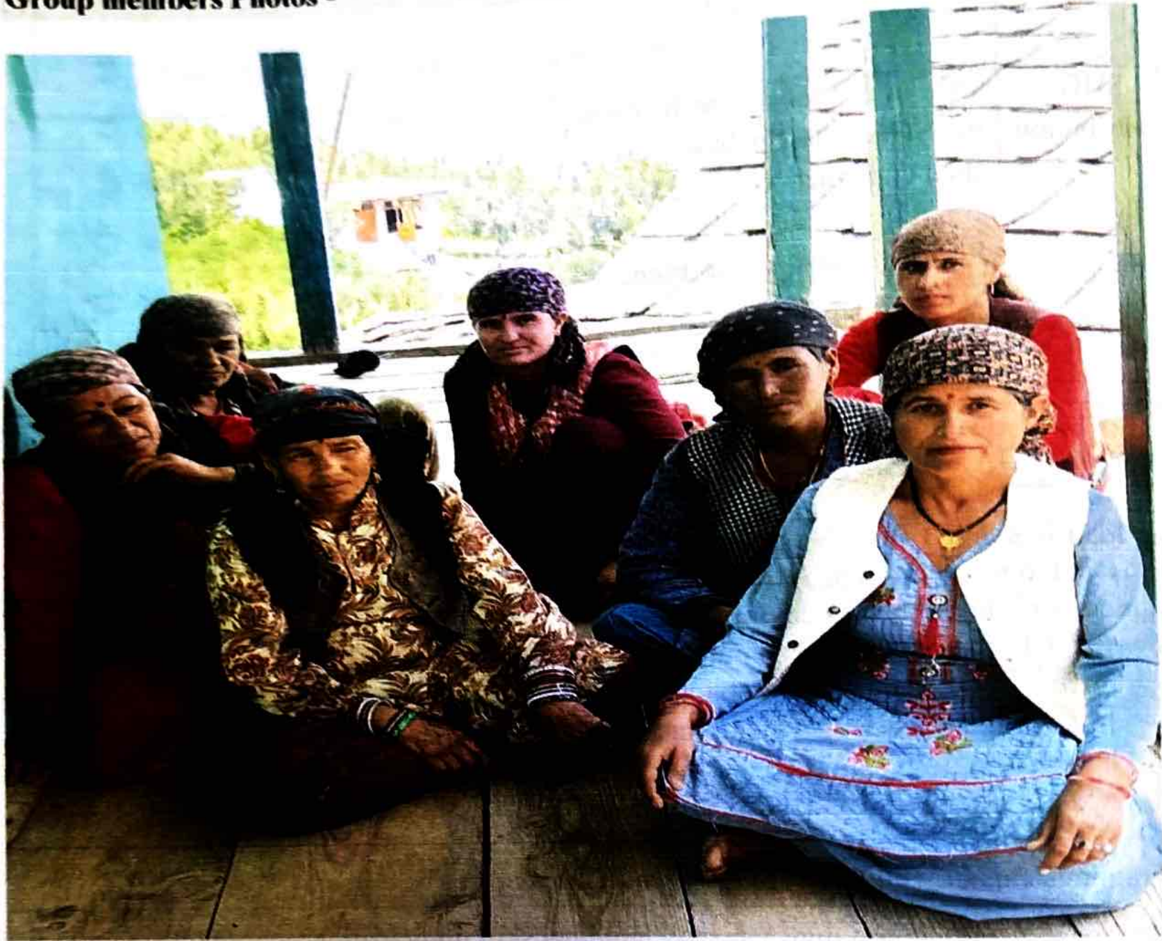
Group members Photos -